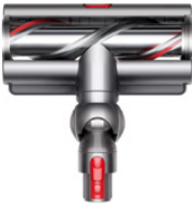
High Torque cleaner head