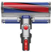
Soft Roller cleaner head