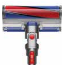
Soft roller cleaner head