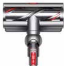
High Torque cleaner head